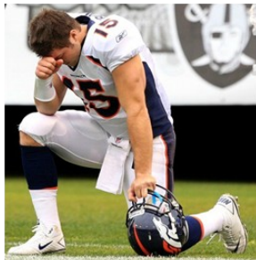
Tim Tebow in a power prayer stance termed Tebowing.